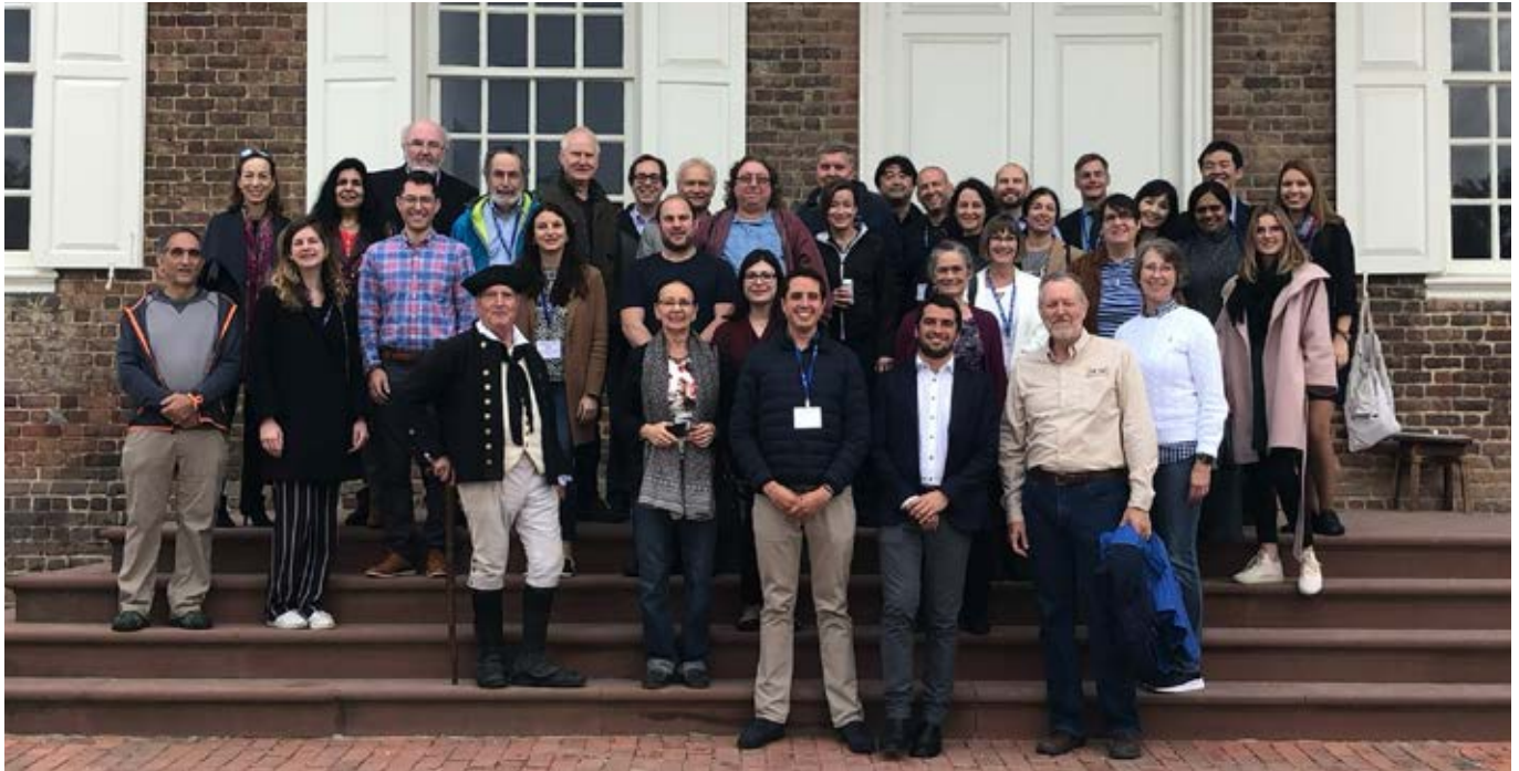
Group photo with the speakers at the door of the Colonial Williamsburg Courthouse