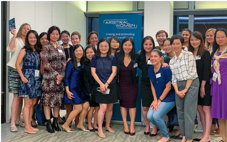
Attendees to the ArbitralWomen SpeedNet.