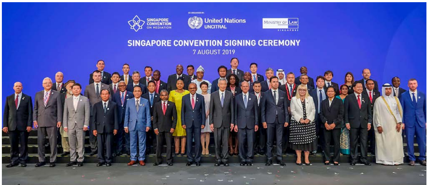
The Signatory States Delegates

In December 2018, the United Nations Convention on International Settlement Agreements Resulting from Mediation was adopted. The Convention, abbreviated as: The Singapore Convention on Mediation, comes 60 years after the New York Convention entered into force, in 1959. While only 10 countries initially signed the New York Convention, which today has 160 signatories, the Singapore Convention got off to a tremendous start, with 46 countries signing the convention on 7 August 2019.