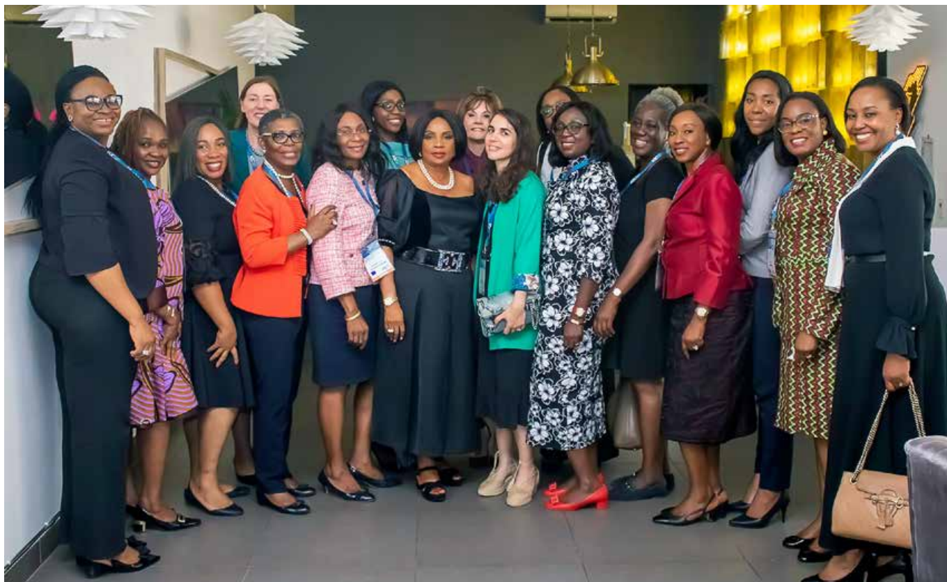
Some of the participants at the conference and the ArbitralWomen luncheon on 19 June 2019 in Lagos, Nigeria

This edition of the Newsletter is dedicated to reports authored by ArbitralWomen members on events that took place in the second quarter of 2019.