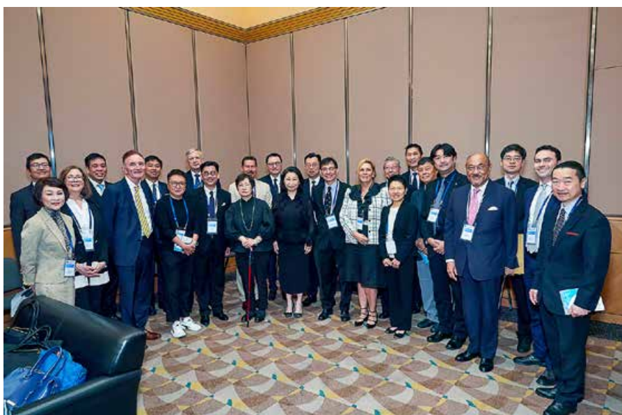
Group picture including SoJ Teresa Cheng and HK DoJ senior staff, speakers and other invitees to the dinner preceding the event.