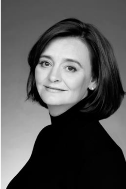
Cherie Blair CBE, QC

You are the Founder and Chair of Omnia Strategy LLP (“Omnia Strategy”) which you set up in 2011. What influenced you to leave a successful practice at the Bar and to start Omnia Strategy?