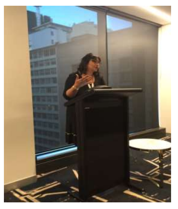
Rashda Rana SC, ArbitralWomen President

Rashda, in an impressive "tour de force" , started by recognising that being sensitive to culture was an important element of international arbitration.