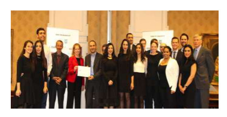
Middle East Pre-Moot in Amman