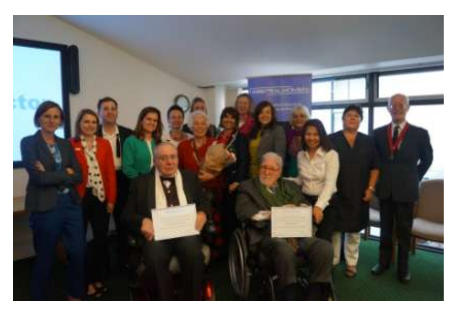
Colleagues and friends present at the ceremony

ArbitralWomen were delighted that both Honourable Men joined the guests for the Gala Dinner at the Imperial War Museum following the ceremony at the Chartered Institute of Arbitrators.