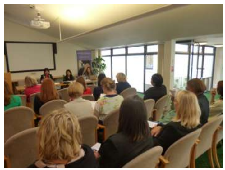
ArbitralWomen Annual General Meeting at the Chartered Institute of Arbitrators