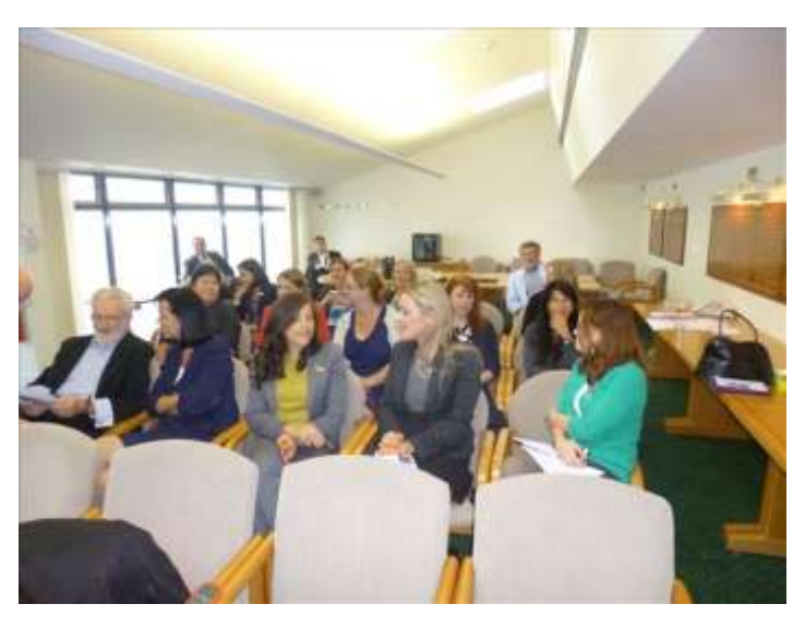
Friends start arriving for the Honourable Men ceremony