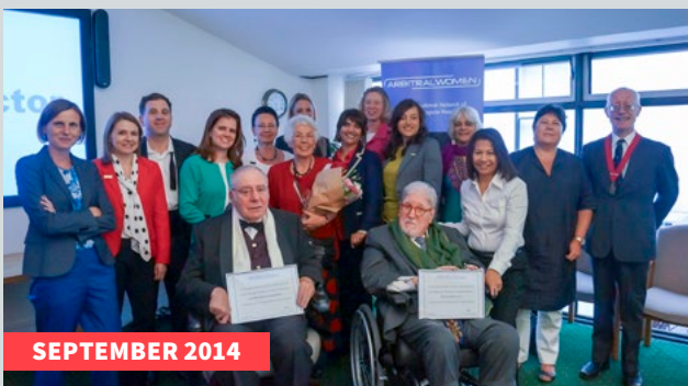
Third Gala Anniversary Celebration in London in September 2014