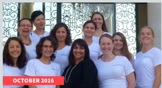
First ArbitralWomen Board Working Weekend in Chantilly (France) in October 2016