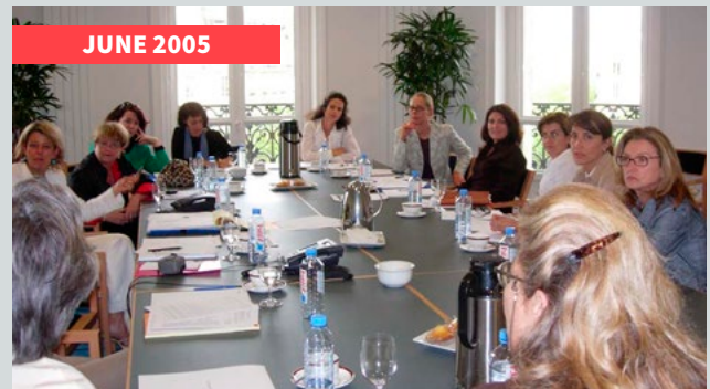
Drafting the Bylaws in Paris in June 2005 for the incorporation of ArbitralWomen