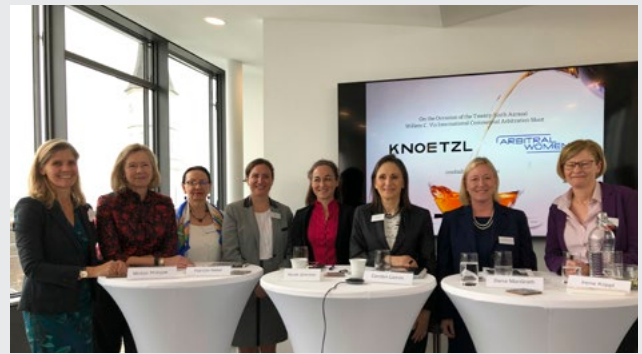
Conference in Vienna – 14.04.2019