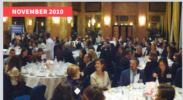
Second Gala Anniversary Celebration in Paris in November 2010