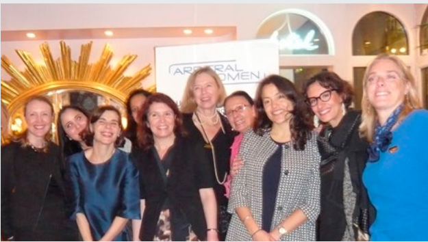
Board members – 22.11.2018