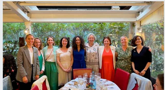
Former-Current Board – 07.07.2022