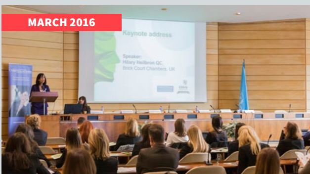
Conference Day on Diversity in Arbitration in Paris in March 2016