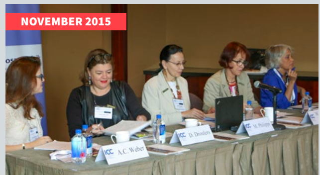
First Panel on Unconscious Bias in Miami in November 2015