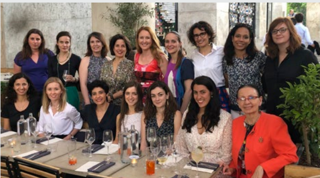
Summer dinner – 16.07.2019