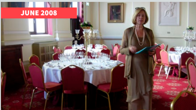
First Gala Anniversary Celebration in Dublin in June 2008